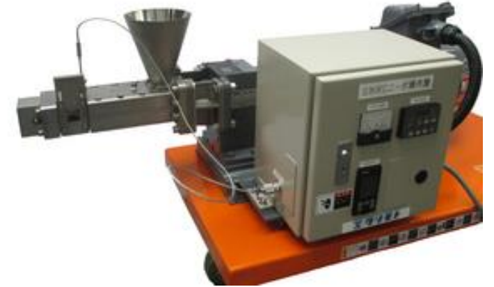
S1 KRC Kneader

※Cooling, pulverization and pelletizing is possible